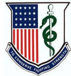
61 st Medical Company