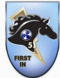
51 st Forward Support BN