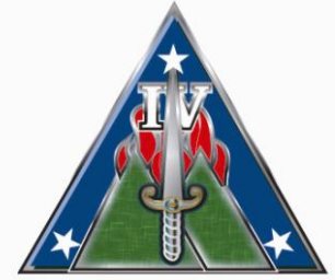
4 th Regiment