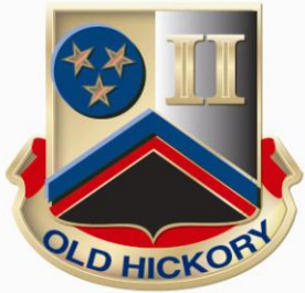
2 nd Regiment