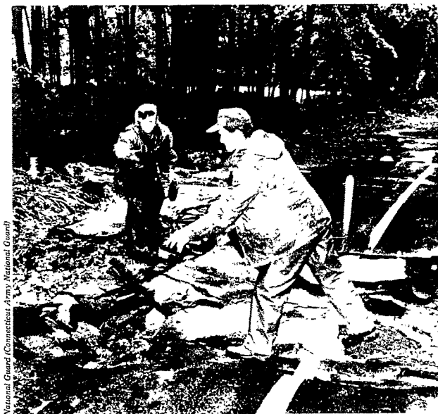
National Guard (Connecticut Army National Guard)