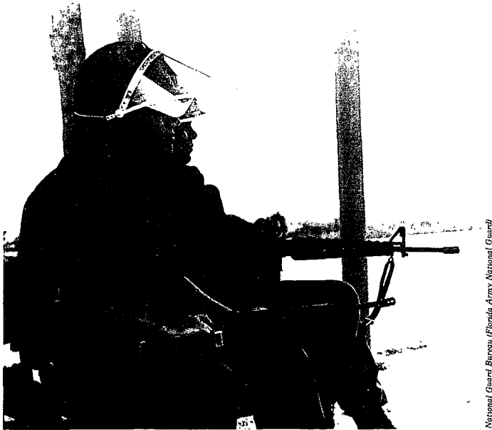
National Guard Bureau (Florida Army National Guard)

Florida Army National Guardsmen were called out to assist state police during the riots in Miami in 1980